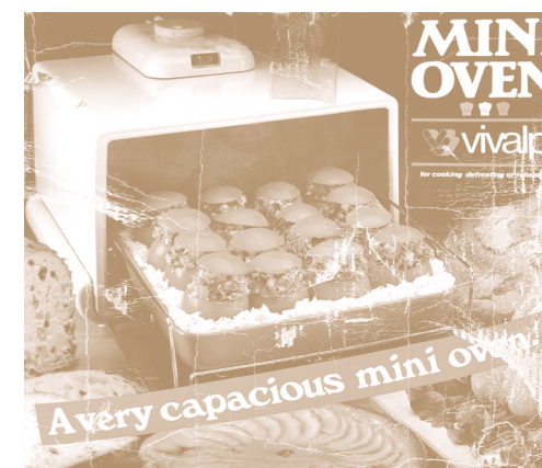
A very typical use of Windsor

It's this humanizing quality that is most likely why designers in the early 1970s resurrected these three typefaces, when the techno-utopia of Star Trek was beginning to curdle into the techno-dystopia of THX 1138 . If all of the room-sized IBM and Rand Corporation computers coordinating various mechanized atrocities across the globe had a chilly, efficient Swiss typeface like Helvetica slapped on the side of them, warmer, more handmade typefaces seem like both a respite and a quiet protest. In any era marked by political and social turmoil, there's often an effort to call back to the more humane (and certainly, the idealized) aspects of an earlier era. All three, in an oblique way, call to mind the fantastical egalitarianism of the Belle Époque, when strains of mysticism, industrialism, and socialism intermingled in the public imagination. Designing an underground publication or radical flyer in 1970, alluding to that era was a type of resistance against the